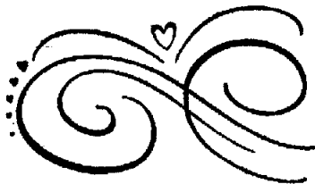
Top: A Single Rose by Verses #1127E, 3" x 1½", $9.95

A single rose can be my garden... a single friend, my world. Lee Brumby